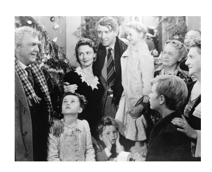
It's a Wonderful Life

December brings more family-friendly fun with the new Disney adventure Moana 2 and the long-awaited musical fantasy Wicked . Ralph Fiennes stars in mystery-thriller Conclave , and we'll be bringing you plenty of festive favourites to kickstart your Christmas celebrations, including our traditional screenings of It's a Wonderful Life .