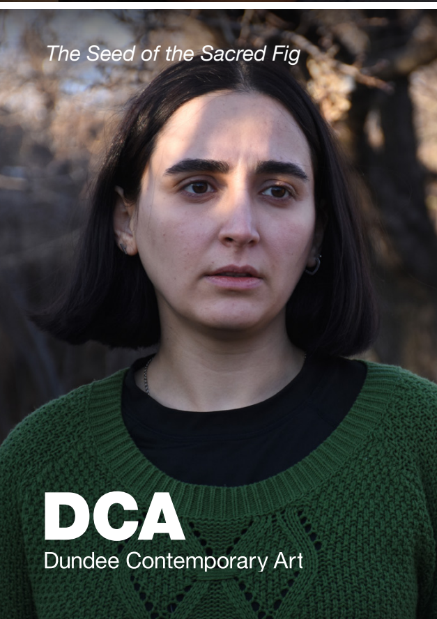
The Seed of the Sacred Fig