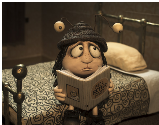
Memoir of a Snail