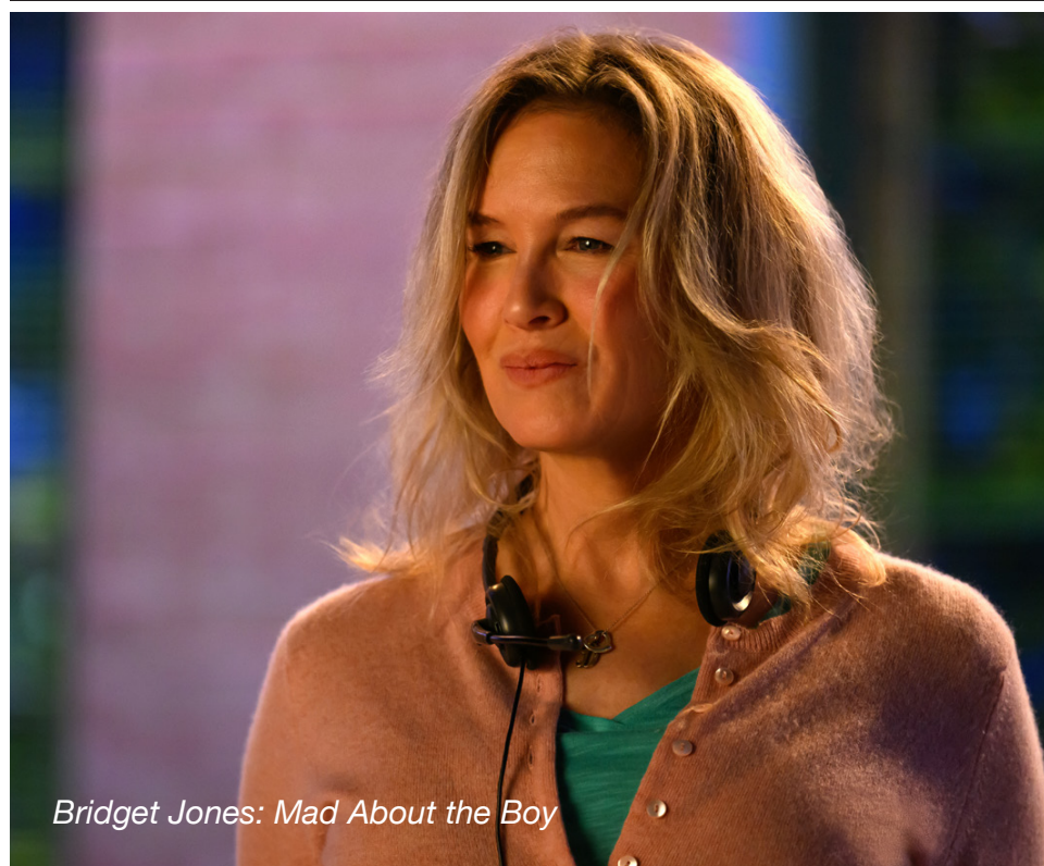
Bridget Jones: Mad About the Boy