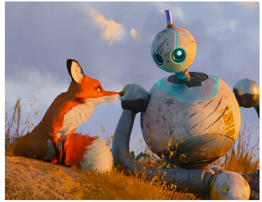
The Wild Robot

Enjoy the award-winning The Wild Robot to celebrate the school half-term break! There's comedy in Bridget Jones: Mad About the Boy and NT Live: The Importance of Being Earnest , and a chance to see Brief Encounter back on the big screen for its 80th anniversary. There's more gripping drama in Oscar-nominated Iranian thriller The Seed of the Sacred Fig and blood-soaked Irish revenge tale Bring Them Down .