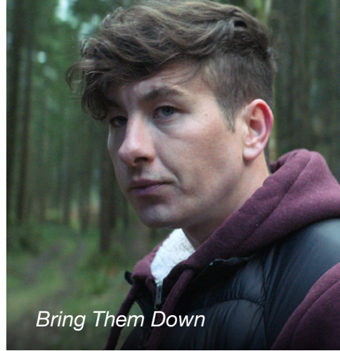
Bring Them Down