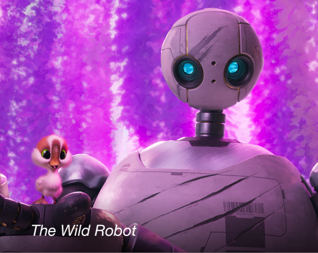
The Wild Robot