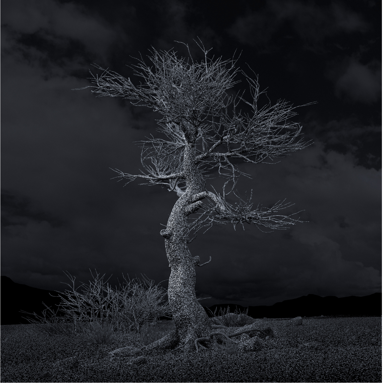
Pillars of Dawn (III) , 2015 – 2017, C-print