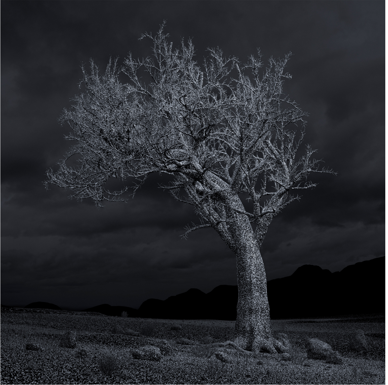
Pillars of Dawn (II) , 2015 – 2017, C-print