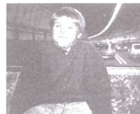
RODERICK BUCHANAN 'GOBSTOPPER' 1999 STILL FROM 14 MINUTE VIDEO

'Buchanan's work deals with today's crucial questions in a way that refuses cynicism or ironic distancing and enthusiastically embraces and commits itself to the world.' Jean-Marc Huitorel, Art Press