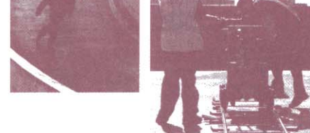
'OUT' 2000 PRODUCTION STILLS

RODERICK BUCHANAN 'PLAYERS' 25TH NOVEMBER 2000 – 4TH FEBRUARY 2001