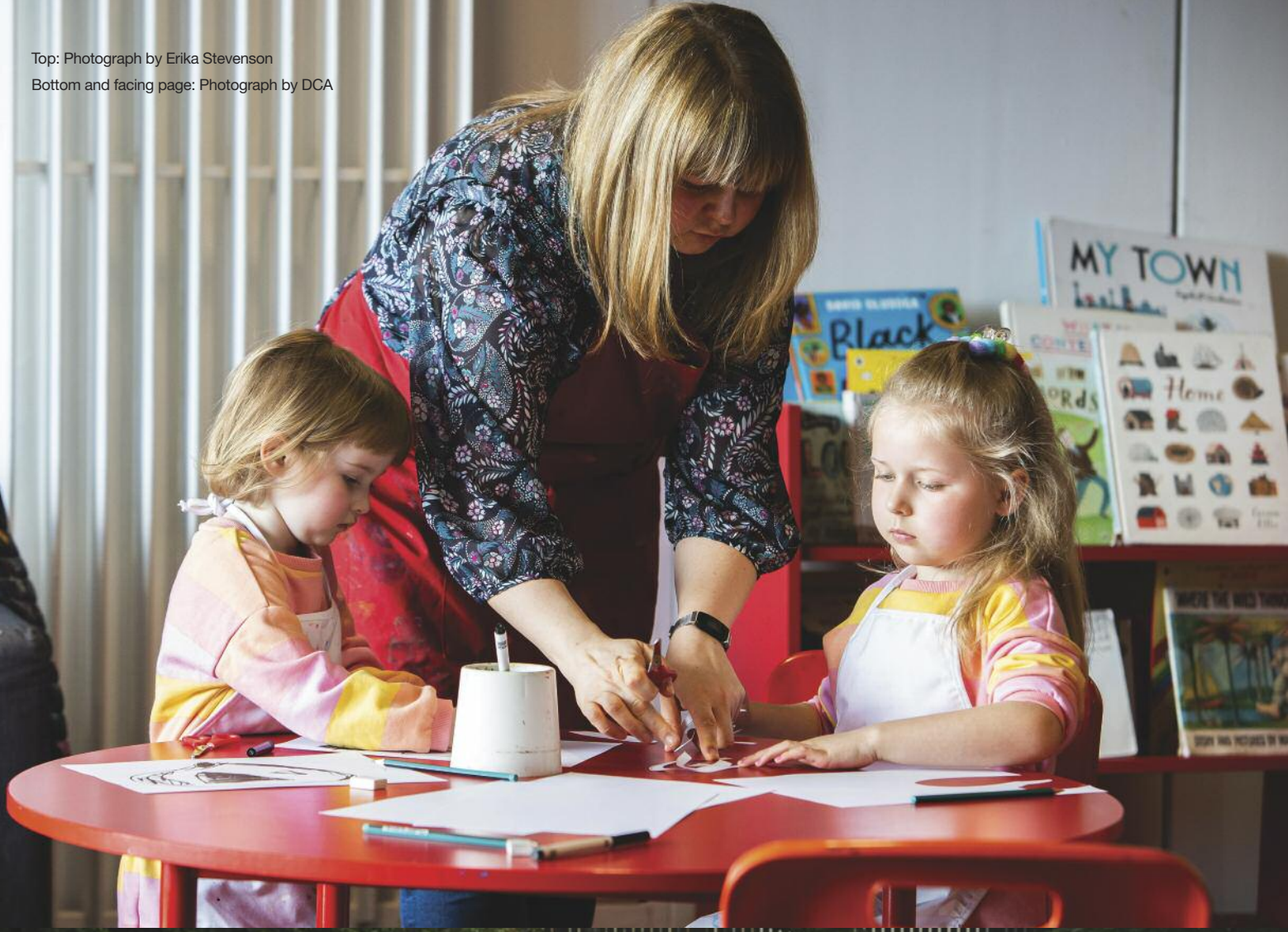
Top:  Bottom and facing page: