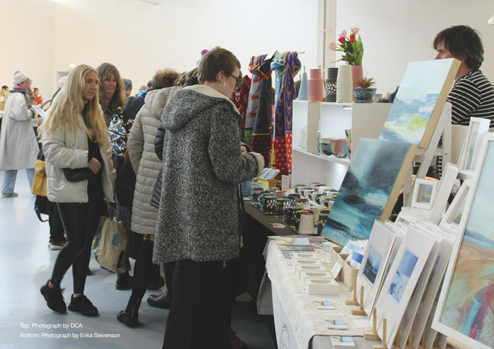
Top: Photograph by DCA Bottom: Photograph by Erika Stevenson