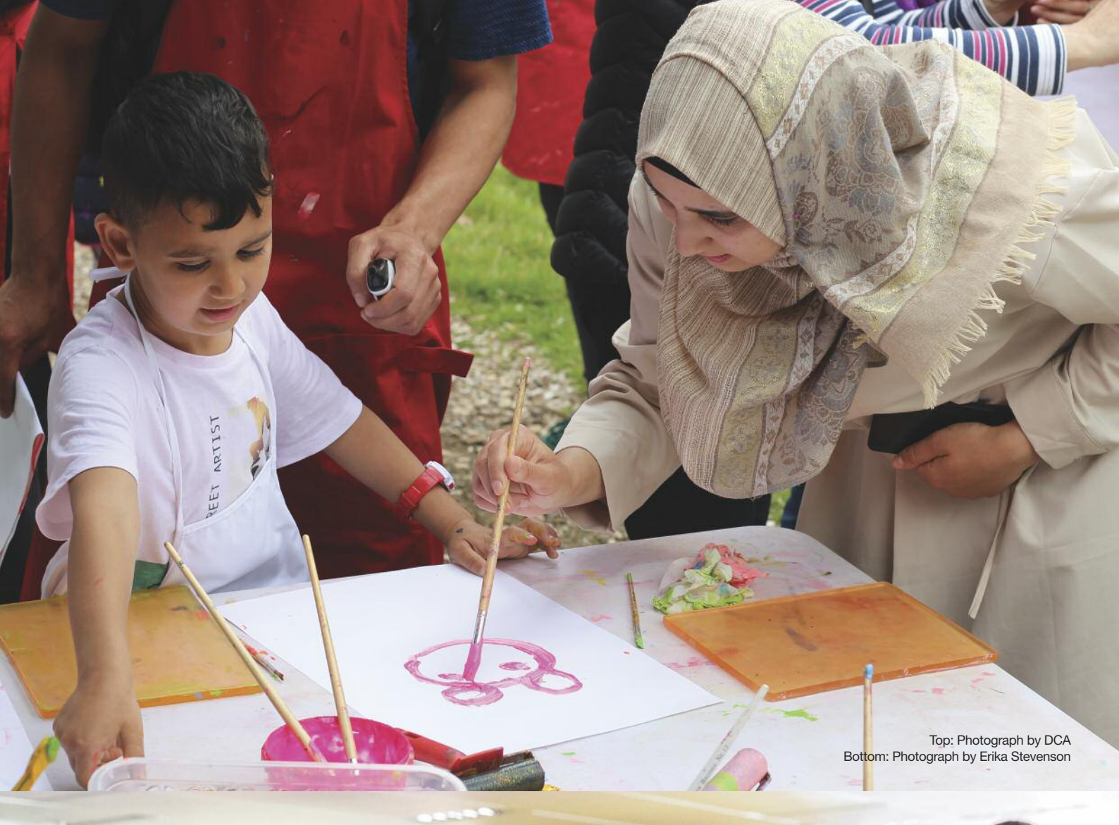
Top: Photograph by DCA Bottom: Photograph by Erika Stevenson